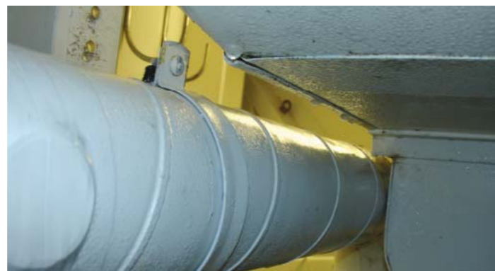
Image 1: Dirty ductwork can introduce mould, dust and other irritants into the indoor air.