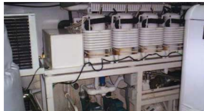
Image 10: A chiller with four stages (four compressors) of cooling. If properly adjusted, the control system will automatically activate the compressors only when needed to maintain the proper water temperature.

While health symptoms can be caused by a number of things not necessarily related to the indoor environment, it is still prudent to address concerns of poor indoor air quality in a timely manner before conditions become more serious.