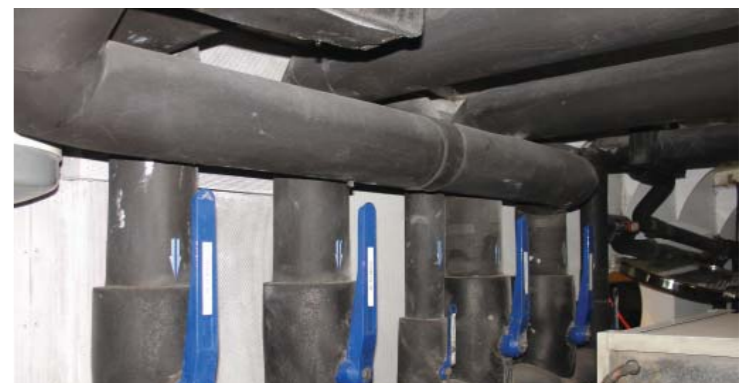
Image 5: This section of duct has insulation missing – as a result condensation and mould growth are forming.